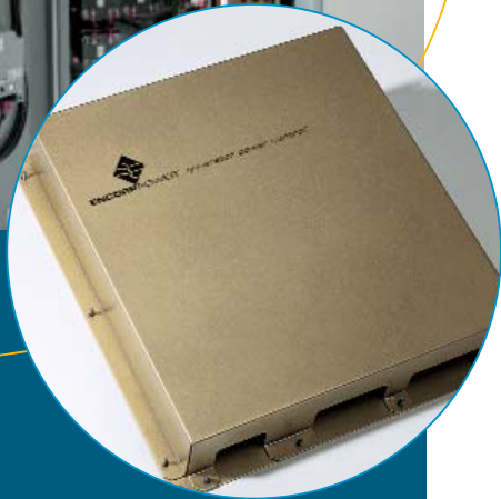
Single Generator Paralleling Switch